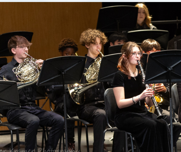
er Kramer Photography